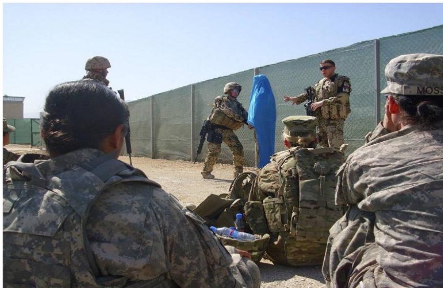
Photo 16: German Military Police members give training on how to conduct a body search on an Afghan female to members of the ISAF Engagement Teams, Afghanistan

Several gender courses and training opportunities, like Advanced Distributed Learning (ADL) are developed by different organisations. For personnel positioned on gender advisory functions some of these trainings are mandatory. For CIMIC personnel this training can improve their gender awareness and mission effectiveness when included in the mission pre-deployment training. The CCOE has included gender awareness as a learning objective in the NATO Field Worker Course (NCFWC) and NATO Staff Worker Course (NCSWC). See annex B for an overview of gender training possibilities.