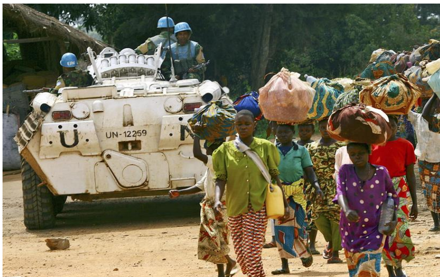
Photo 7: Villagers going to the local market in Bogoro walk past a Bangladeshi patrol unit of the United Nations Mission, Democratic Republic of the Congo

initial stages of sudden onset emergencies as well as in recurring humanitarian situations. 23