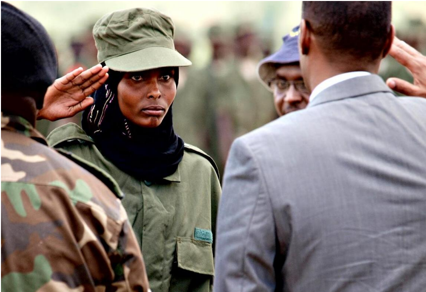
Photo 17: Somalia soldier saluting, she was chosen by her peers as ‘best soldier’, EU training mission Somalia.