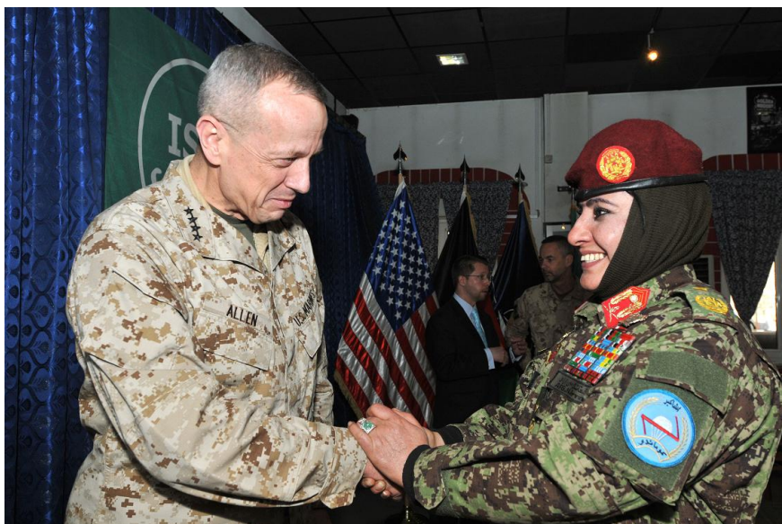
Photo 8: Commander ISAF General Allen welcomes Afghan Brigade General Mohammadzai to ISAF Headquarters, Afghanistan

In 2010 the NATO Action Plan on Mainstreaming UNSCR 1325 into NATO-led operations and missions was approved. This included clear actions to be taken by the Commanders of the NATO-led operations in Afghanistan (ISAF) and Kosovo (KFOR). 24 The action plan is reviewed and updated bi-annually.