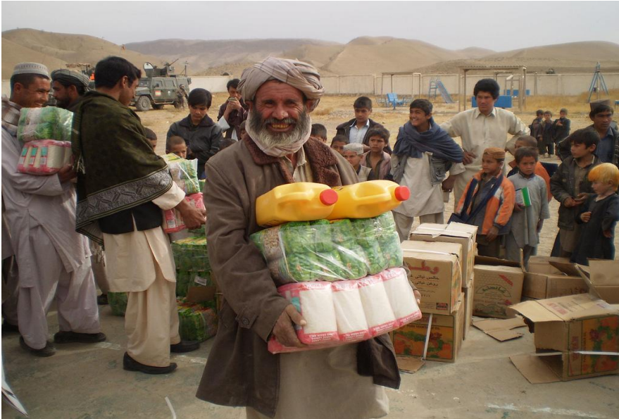
Photo 15: CIMIC team supports the handing out of humanitarian aid, Afghanistan. While executing CIMIC activities it is vital to include a gender perspective; men and women will have different needs and priorities.

During the force generation process the integration of female officers, non-commissioned officers and soldiers on tactical and operational positions must be ensured in order to be able to engage with the entire population if this is deemed culturally appropriate and will benefit the military mission. When it comes to tactical procedures like a house search, check points and body searches it is also beneficial to ensure military forces have sufficient female soldiers to conduct these tasks in a culturally accepted manner. Furthermore, gender advisory functions should be integrated in the manning on both operational and tactical level.