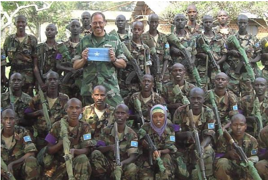
Photo 10: GFA of the EU training mission Somalia posing with his students at the training facility in Uganda. The GFA was responsible for the lectures on human rights and gender related topics.

The present EU Gender Action Plan is based on the Commission's Roadmap for Equality between Women and Men (2006-2010), which covered both internal and external EU policies. This Action Plan is meant to be an operational document that concentrates on a selected number of objectives where the EU has a clear comparative advantage. It proposes a series of activities to be carried out by the EU Member States and the European Commission for the period 2010 to 2015. 28