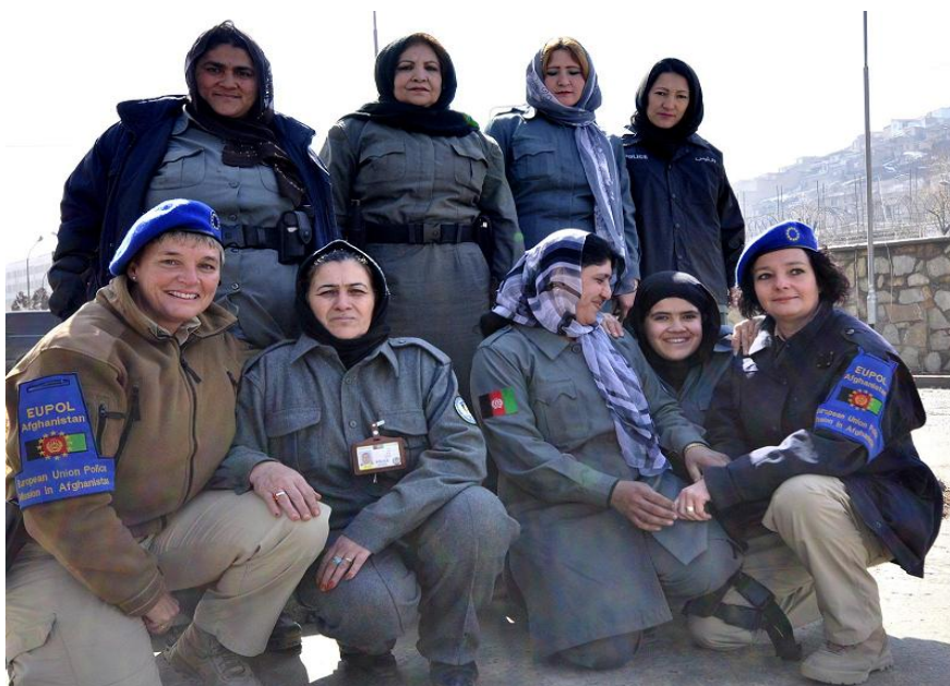
Photo 9: Members of the EU Police Mission are training Afghan police women, Afghanistan

In May 2007 the European Institute for Gender Equality (EIGE) was established. This is a European agency which supports the EU and its Member States in their efforts to promote gender equality, to fight discrimination based on sex and to raise awareness about gender equality issues. Its tasks are to collect and analyze comparable data on gender issues, to develop methodological tools, in particular for the integration of the gender dimension in all policy areas, to facilitate the exchange of best practices and dialogue among stakeholders, and to raise awareness among EU citizens.