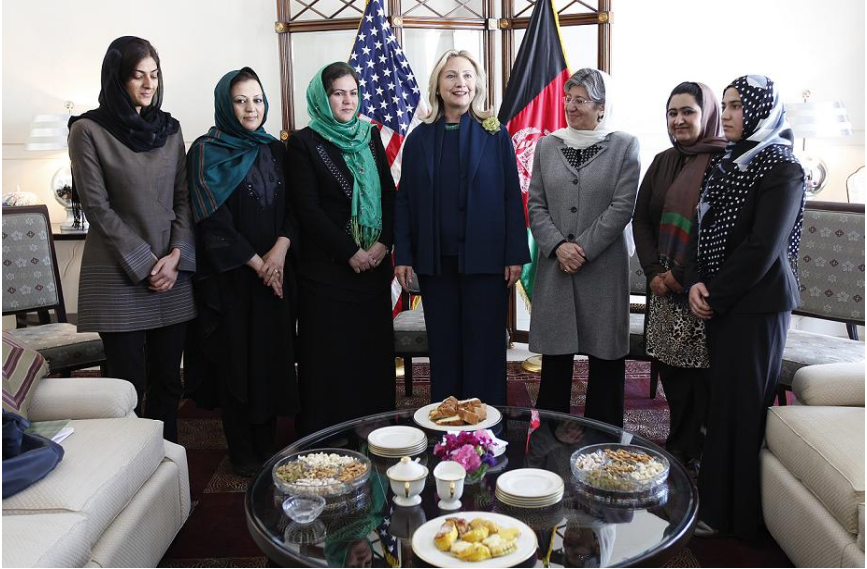
Photo 12: US Secretary of State Hillary Clinton meets with Afghan civil society leaders at US Embassy in Kabul to discuss US long term commitment to Afghanistan

When it comes to Support to the Force , CIMIC plays a proactive role by contributing to the planning and conduct of operations. This includes, in cooperation with other military functions: