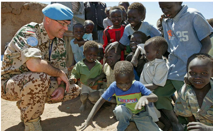
Photo 13: UN officer engaging refugee children in Jebel Aulia, Sudan

The gender analysis tool developed for CIMIC personnel in this publication can be found in Annex C and is based on the framework originally created by Louise Olsson in a study of the Nordic Battlegroup. Olsson structured the Nordic Battlegroup's work to integrate UNSCR 1325 into four different work areas. This framework was further developed to capture aspects of operational effectiveness of implementing UNSCR 1325 in Afghanistan. Structuring the work to integrate UNSCR 1325 in these 4 work areas enables the identification of key issues for each work area. The framework builds on the fact that the Resolution identifies gender as a cross-cutting theme, which means that it has to be considered and integrated in all parts of operations – internally in how they are organized and externally in terms of how they address the situation in the AOO to obtain the desired output. Two main themes cut across the internal and external dimensions, representation (male and female participation) and integration (the use of the content of Resolution 1325 in the process to achieve a desired output). 35