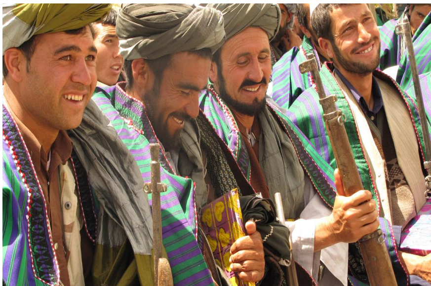
Photo 3: Former Taliban fighters hold rifles as they prepare to hand them over during a reintegration ceremony, Afghanistan

When it comes to men's reintegration, it is important to be aware of the male side of the gender equation and how gender dimensions of violence and militarised masculinities may pose an obstacle.