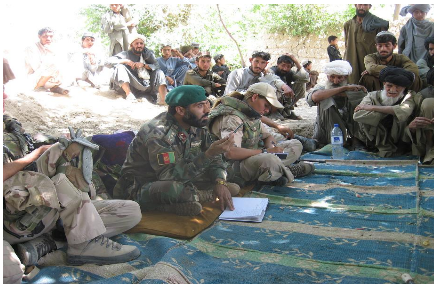
Photo 14: Meeting between CIMIC team, local government and local population in Deh Rawod district, Afghanistan

This chapter focuses on the steps that have to be taken and important issues that have to be considered by CIMIC personnel at the tactical and operational level with regard to gender activities. An overview of the different levels can be found in annex A. This chapter is divided into three stages: pre-deployment, execution and transition.