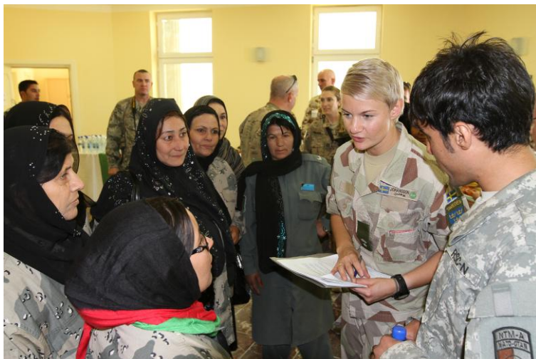
Photo 4: ISAF GENAD talking to members of the Afghan border police at the quarterly Regional Command North Female Security Shura, Afghanistan

Gender Advisor (GENAD) operates on strategic and operational level and is a resource to the Commander. The GENAD is responsible for the overall implementation of a gender perspective into the planning, execution and evaluation processes of military operations. The GENAD monitors, coordinates and supports the deployed GFAs. 13