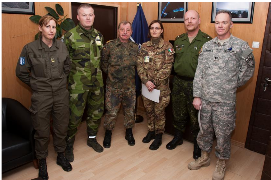
Photo 5: Commander KFOR and his GENAD meet with the GFPs from KFOR HQ, Kosovo

All military personnel should include a gender perspective in their tasks and responsibilities. As gender is a cross-cutting theme, it affects all lines of operations. For CIMIC personnel implementing a gender perspective to their day-to-day work is vital for implementing any mandate. GENADs and GFAs should be consulted for advice on how to do this in the best possible way. Another tool to ensure a gender perspective in CIMIC activities is to have a GFP within the CIMIC staff and units.