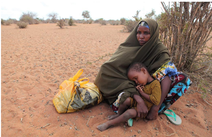
Photo 6: A Somali woman and her son rest on their way to a refugee camp in Kenya; 80% of the world's refugees are women and children 18

At the time, there was doubt by some members of the Council about embracing these issues. The eventual adoption of resolution 1325 can be attributed to several factors. In particular the efforts, determination and personal conviction of several individuals serving on the Council at the time: the permanent representatives of Bangladesh, Namibia, Canada, Jamaica and Mali; as well as the influence of women's NGOs carrying forward the Beijing Platform for Action; all working within an environment of assessment of the UN's overall approach to peace operations.