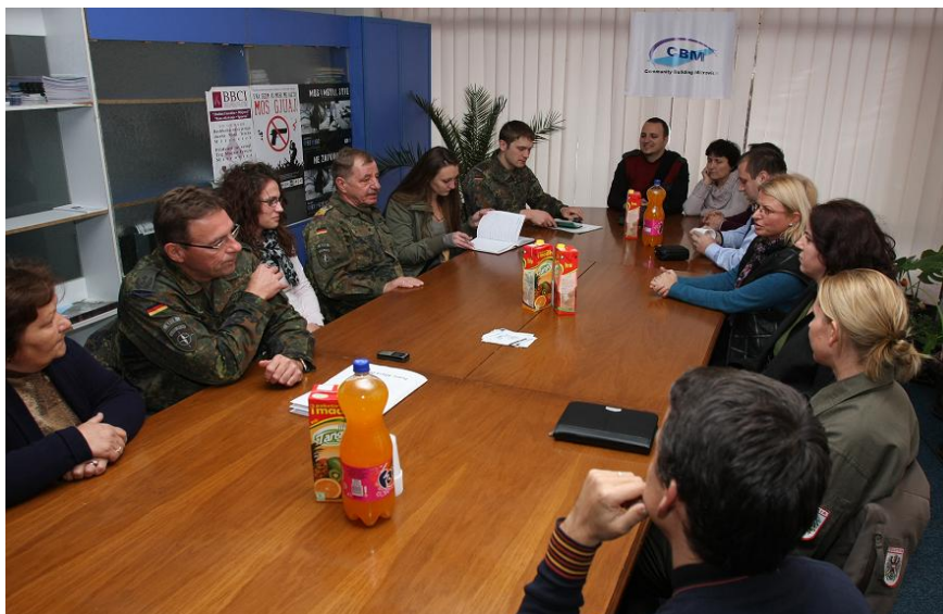
Photo 11: Meeting between Commander KFOR and some of his staff members and a local NGO to discuss possible cooperation, Kosovo

grounds, within our own missions and institutions as well as in rebuilding post-conflict societies, is a matter of operational effectiveness. This implies changes in the way we implement plans and conduct operations. 30