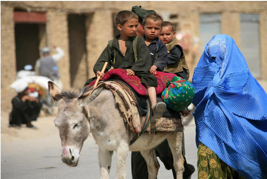
Photo 1: Local Afghan family takes a stroll through the local market as ISAF soldiers conduct a routine village patrol, Afghanistan

These questions will be answered in the following chapters. Chapter 2 looks into the definition of gender, different gender terms and gender advisory functions. Chapter 3 gives an insight into the legal framework relevant to gender, especially UN Security Council Resolution (UNSCR) 1325. Chapter 4 deals with the gender focused or gender related activities of three major international organisations: UN, NATO and EU. Chapter 5 explains the term comprehensive approach and the positive effects of integrating a gender perspective while executing CIMIC activities. Chapter 6 sets out to explain important aspects of including a gender perspective at the tactical and operational level. This publication will conclude with a summary, followed by a set of explicit recommendations.